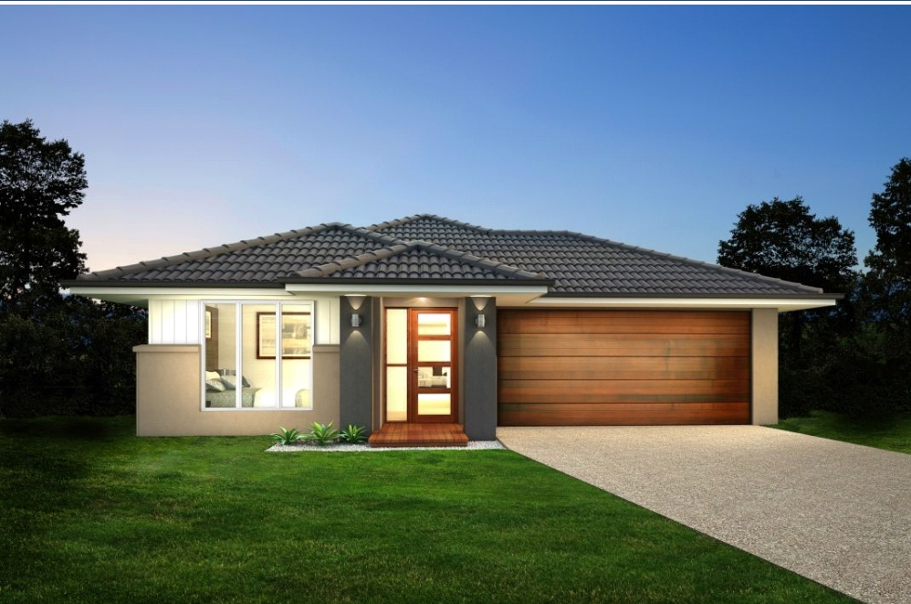
Image depicts items not supplied by Metricon namely landscaping, fencing, timber decking and paths. Image contains upgrade items.