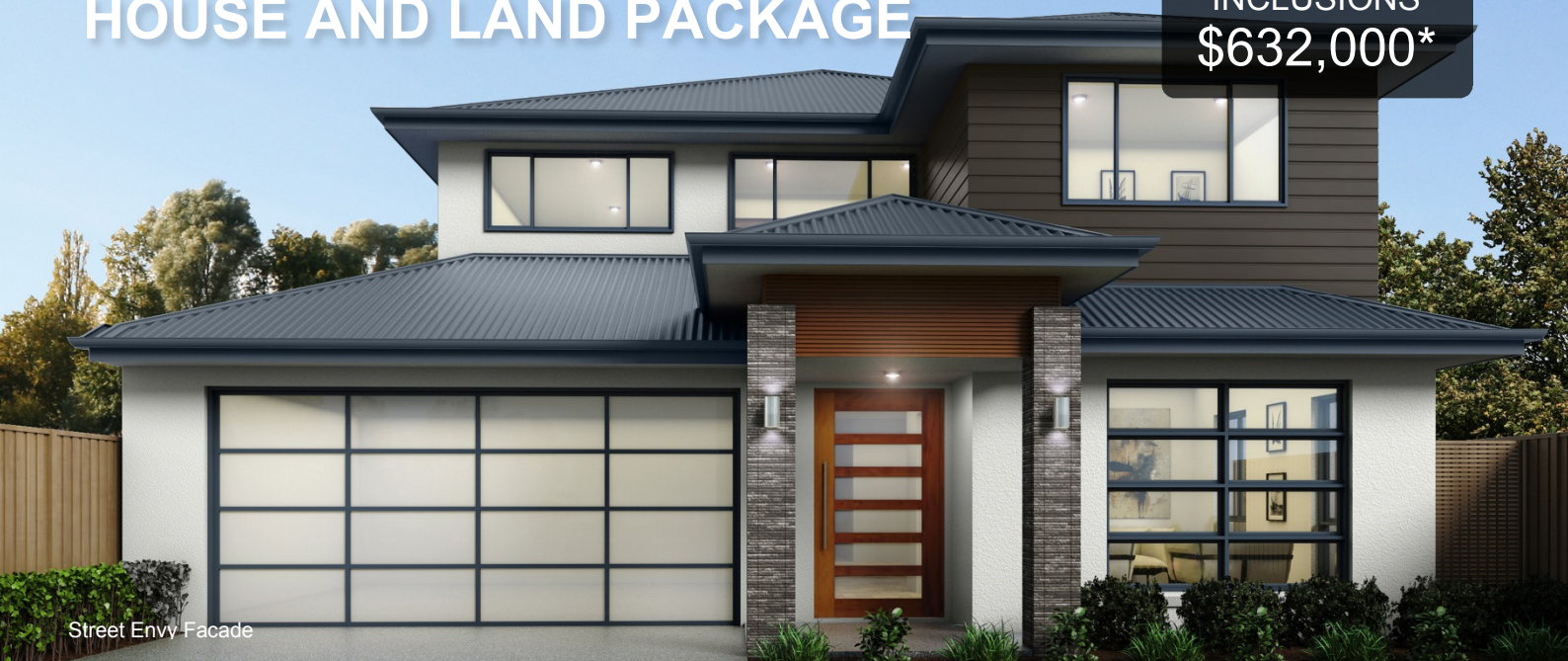
Street Envy Facade